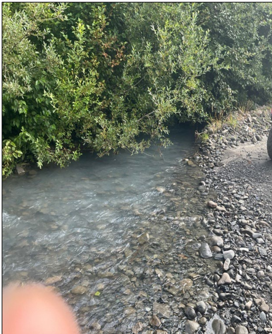
Figure 1.–Stream paralleling the road, looking upstream at waypoint 1180.