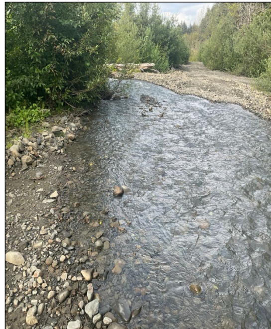
Figure 2.–Stream crossing the road at waypoint 1180.